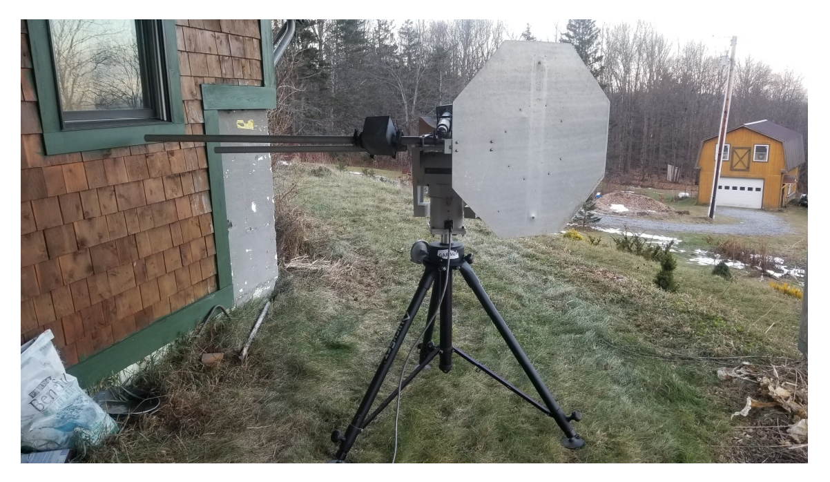
Figure 4 – Flyswatter in horizontal configuration

It occurred to me that I could set up a horizontal periscope system, with both dish and flyswatter near ground level, to do a direct comparison and verify performance. On a spring-like day in December, I retrieved the old flyswatter from the woods and set it up on an antenna positioner, shown in Figure 4. The positioner was recently acquired in hopes of using the positioner for an EME dish, but here is used to move flyswatter in both azimuth and elevation. The experiment was to compare the horizontal periscope, using my backup 10 GHz system, which has an 18-inch dish, with the 24-inch dish of my usual 10 GHz system.