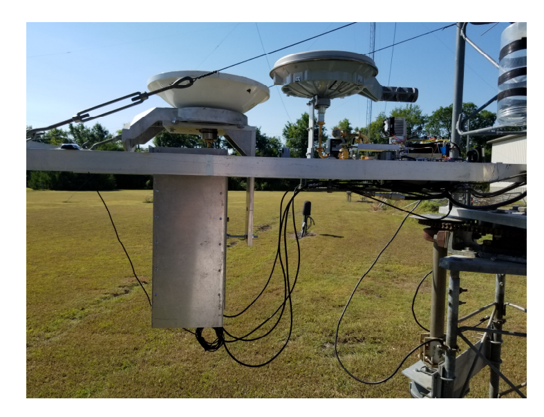
Figure 3 – W5LUA 47 & 78 GHz dishes at base