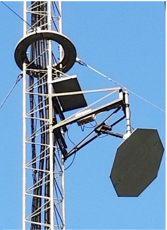
Figure 2 – W5LUA Flyswatter on rotating tower

Many novel amateur antennas are cited as working well based on making contacts, without any actual performance data. I was never able to verify that my periscope system actually performed as well as calculated – that would have involved moving a comparison system up the tower. However, at my current QTH in Vermont, the terrain slopes off to the west so that I am able to operate 10 GHz from ground level and monitor two beacons continuously – I have the rig outside the shop door ready to go whenever conditions warrant. But trees are growing in other directions and I'd like to get above them, so I started thinking about resurrecting the periscope to increase usable directions.