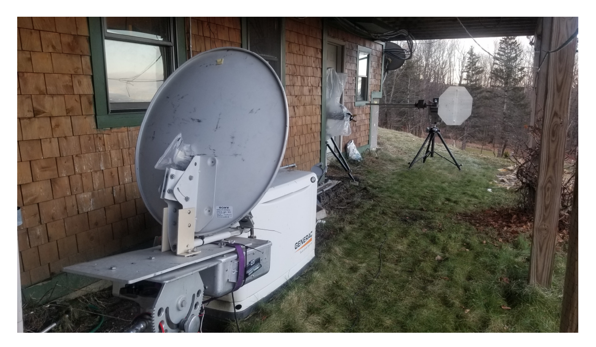
Figure 5 – Horizontal periscope test at ground level